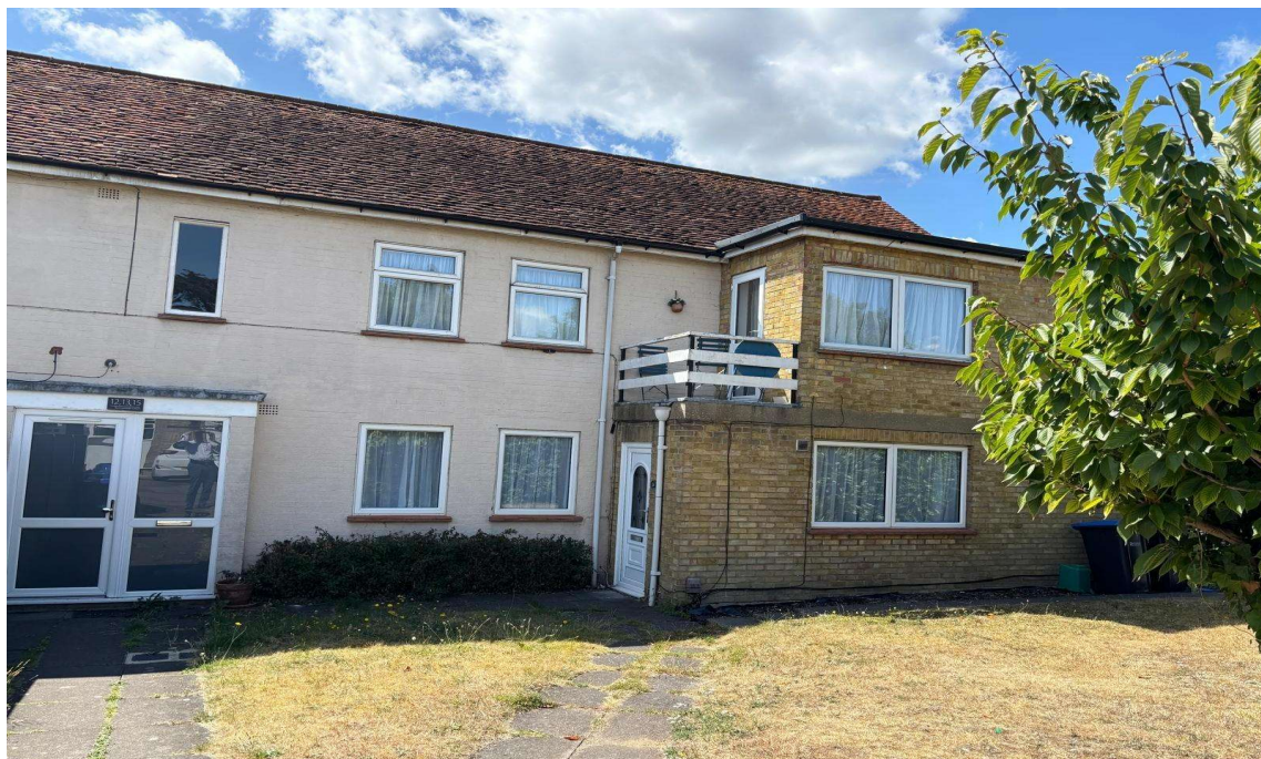
Runnymede Court, Egham, Surrey, TW20 9AAE