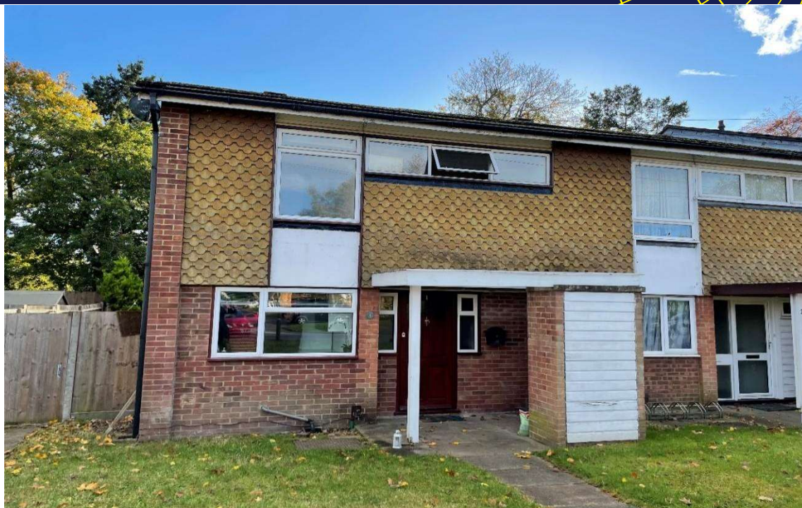
Cherrywood Avenue, Surrey, TW20 0TE