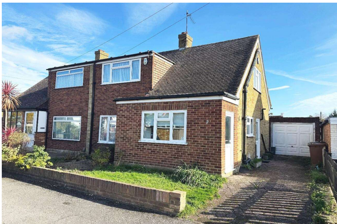
Deridene Close, Stanwell, TW19 7LS