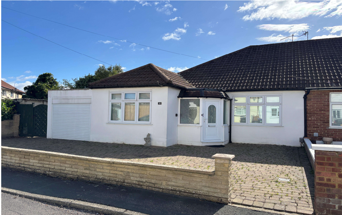
Medlake Road, Egham, Surrey, TW20 8HU