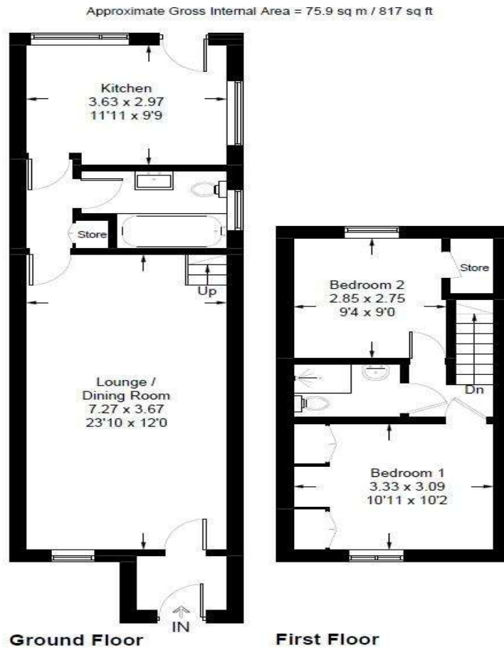
Illustration for identification purposes only. measurements are approximate, not to scale. Fourlabs.co @ (ID1180240)

All measurements are approximate. Nevin & Wells Residential have not tested any systems or appliances.