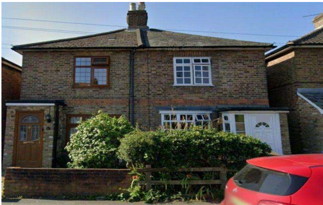
Bond Street, Englefield Green, TW20 0PL