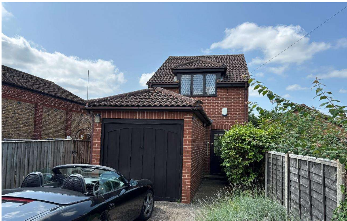
Runnemedede Road, Egham, TW20 9BT