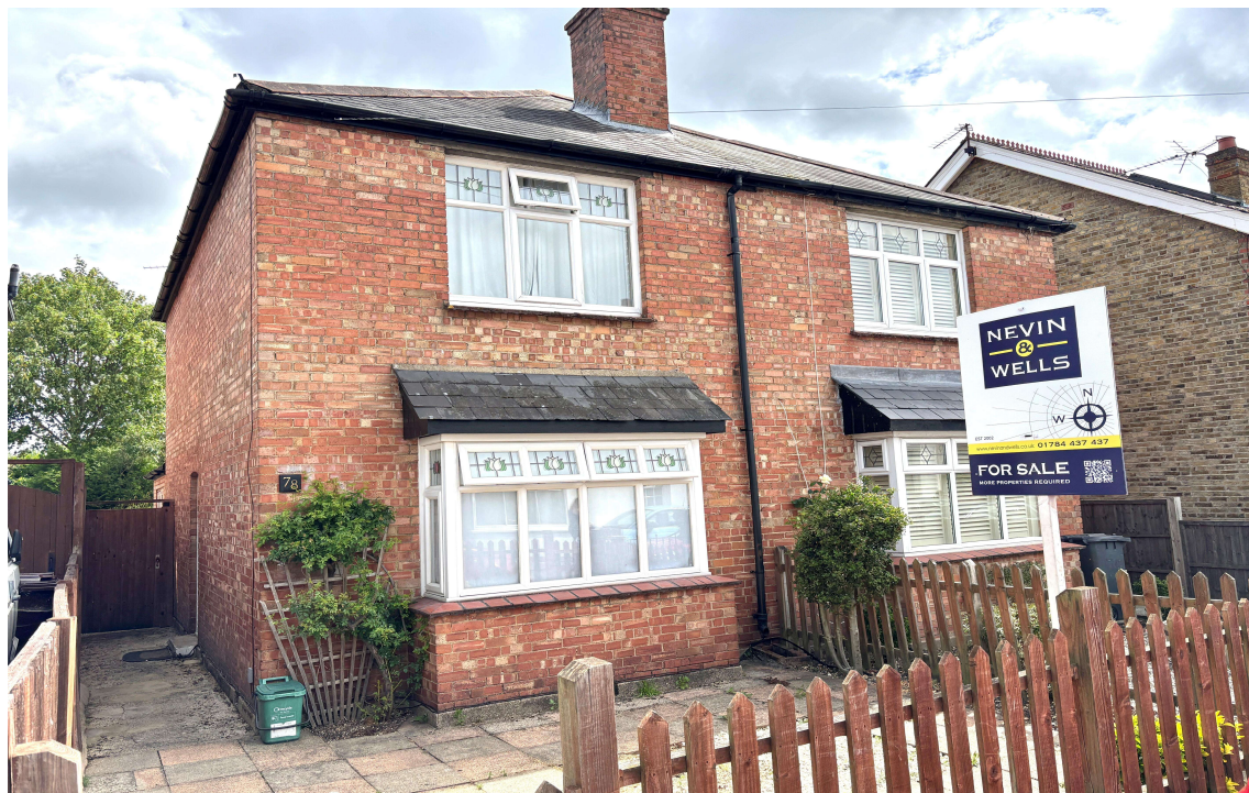
Harvest Road, Englefield Green, TW20 0QR