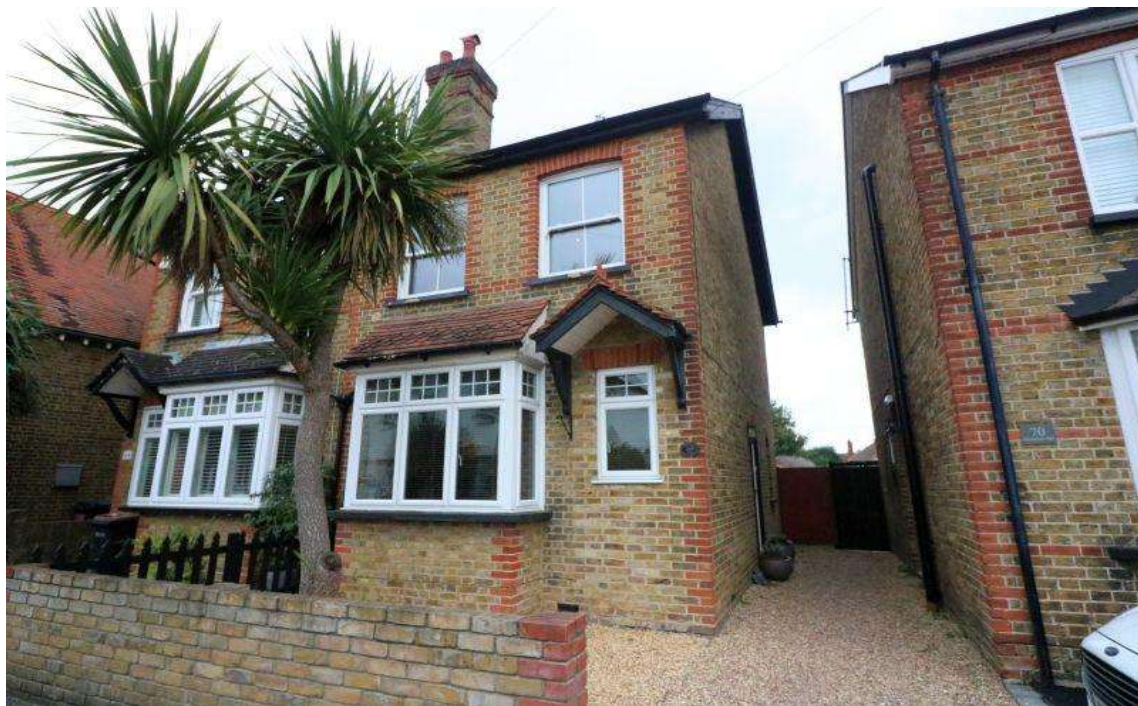
Hummer Road, Surrey, TW20 9BP