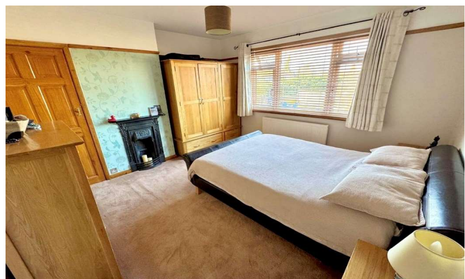
Grosvenor Road, Staines-upon-Thames, TW18 2RP