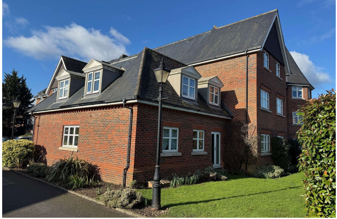
Albany Court, Egham, Surrey, TW20 9GP