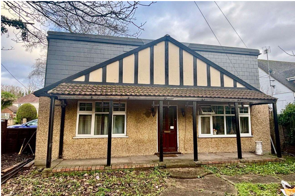
Vicarage Road, Egham, Surrey, TW20 9JW