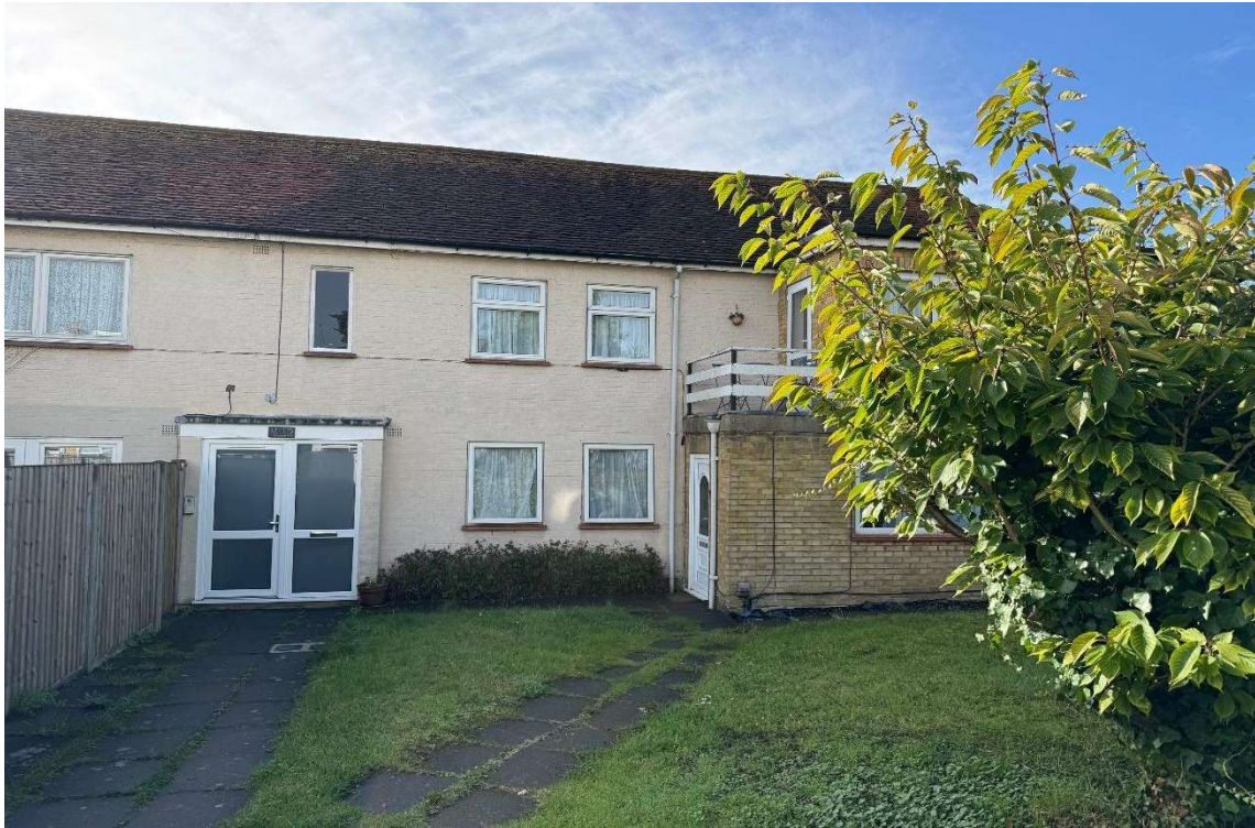
Runnymede Court, Egham, Surrey, TW20 9AA