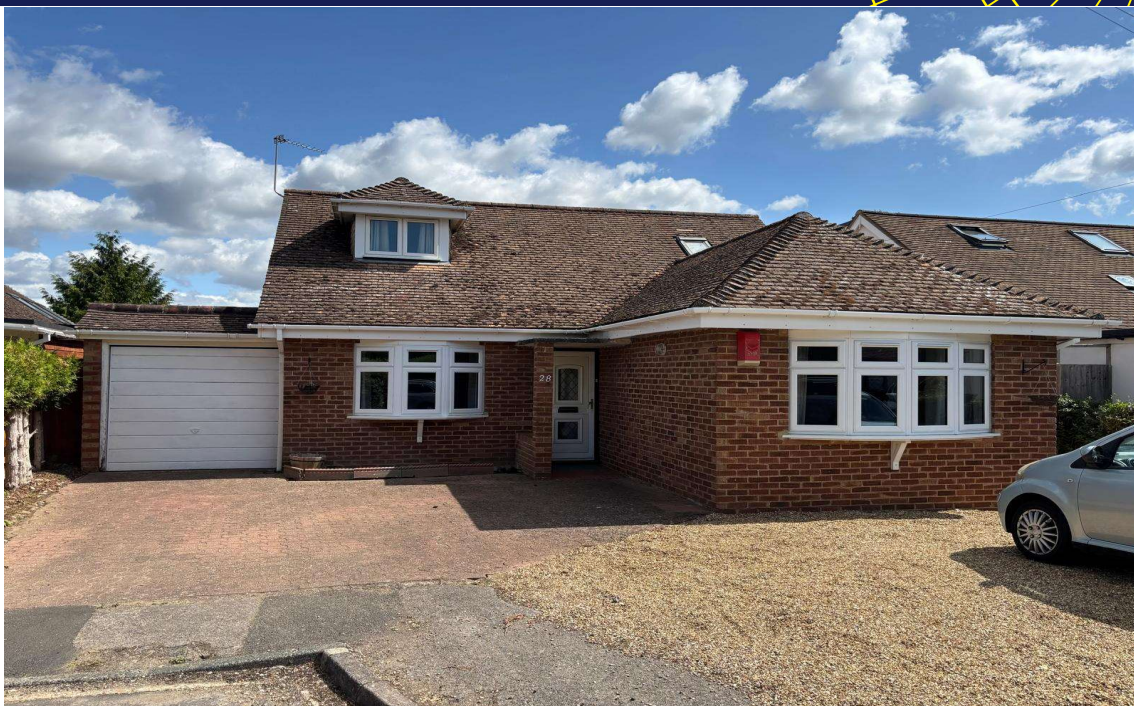
Western Avenue, Thorpe, Surrey, TW20 8QB