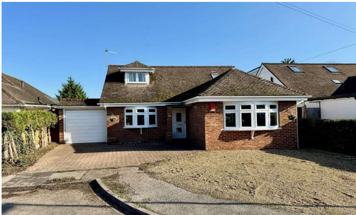
Western Avenue, Thorpe, Surrey, TW20 8QB