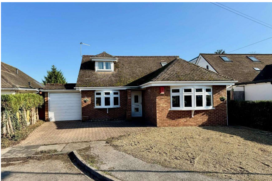
Western Avenue, Thorpe, Surrey, TW20 8QB