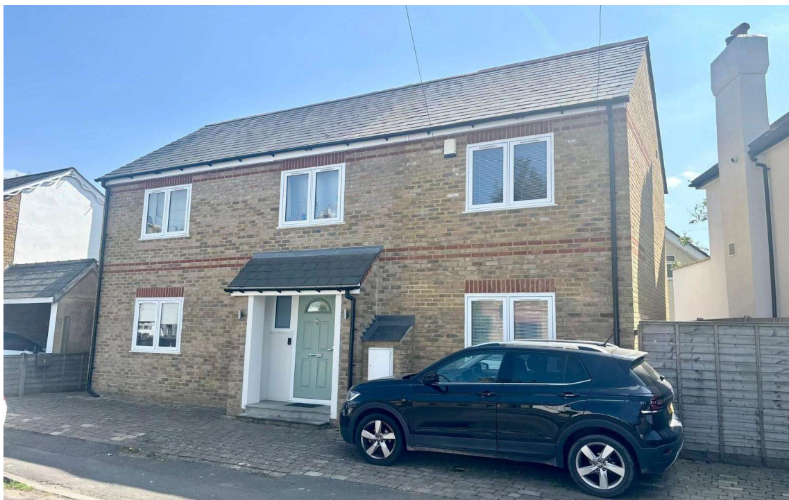
Strode Street, Egham, TW20 9BX