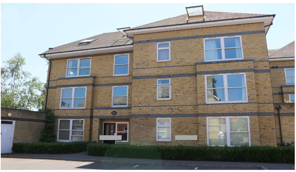
Vicarage Road, Egham, Surrey, TW20 9GL