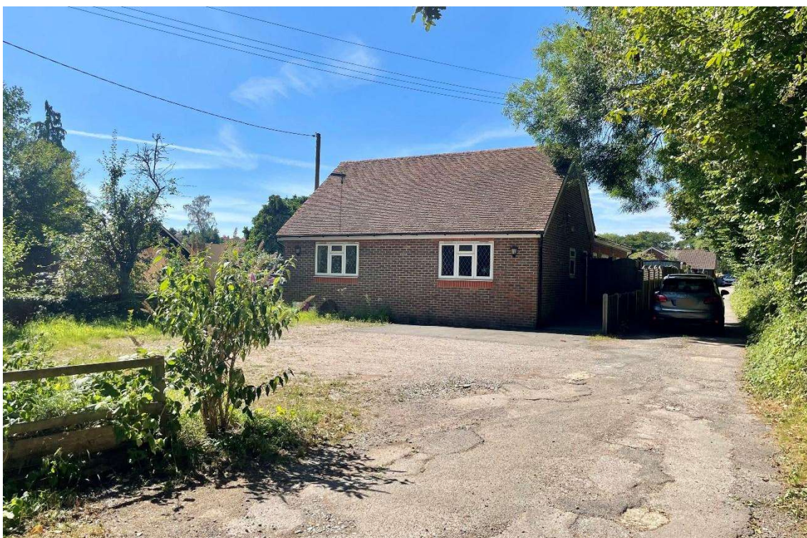
'Nollbrook', Hurst Lane, Egham, TW20 8QJ £775,000 Freehold