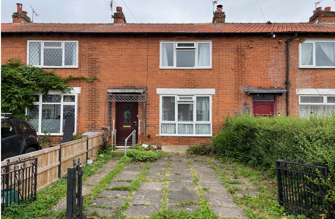
Vegal Crescent, Englefield Green, TW20 0PZ £350,000 F/hold