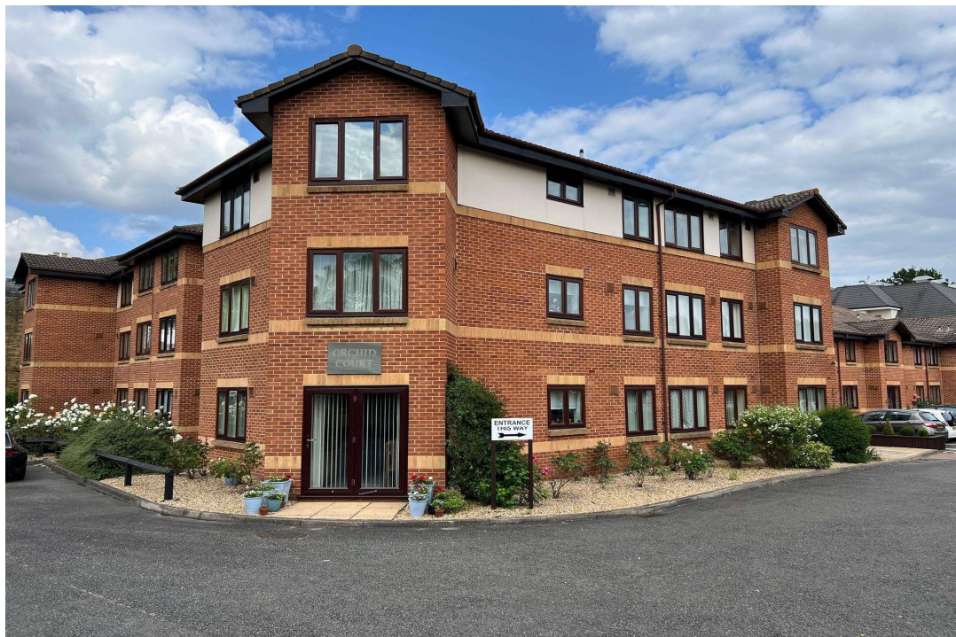
Orchid Court, Egham, Surrey, TW20 9HA £175,000 Leasehold