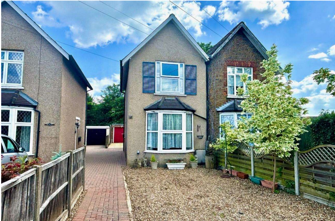
The Grove, Egham, Surrey, TW20 9QJ