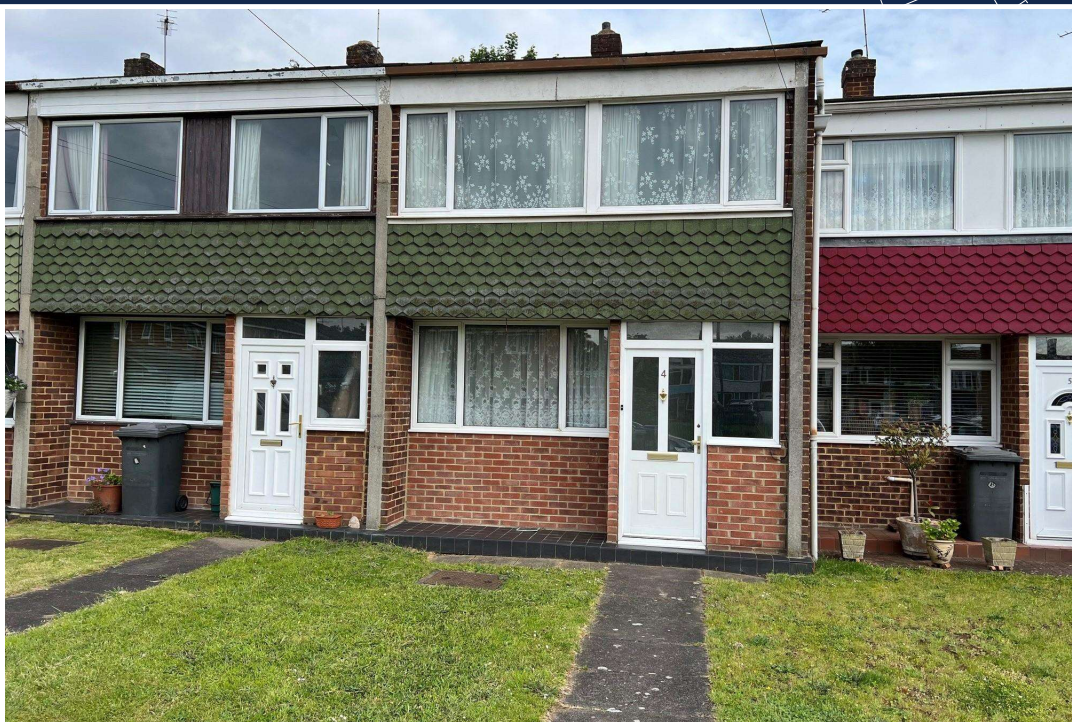
Harcourt Close, Egham, TW20 8BJ