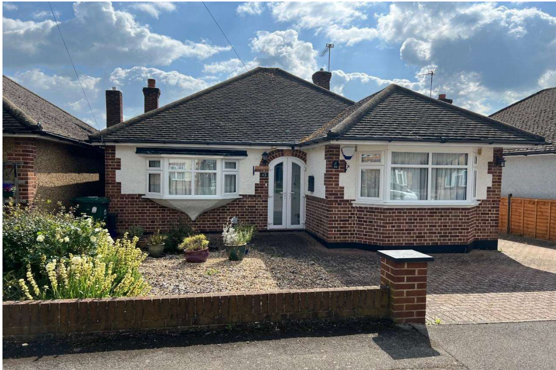
Penton Avenue, Staines, TW18 2NA