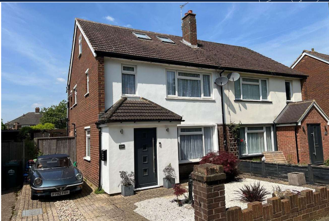
Worple Road, Staines, Middlesex TW18 1HE £625,000 Freehold