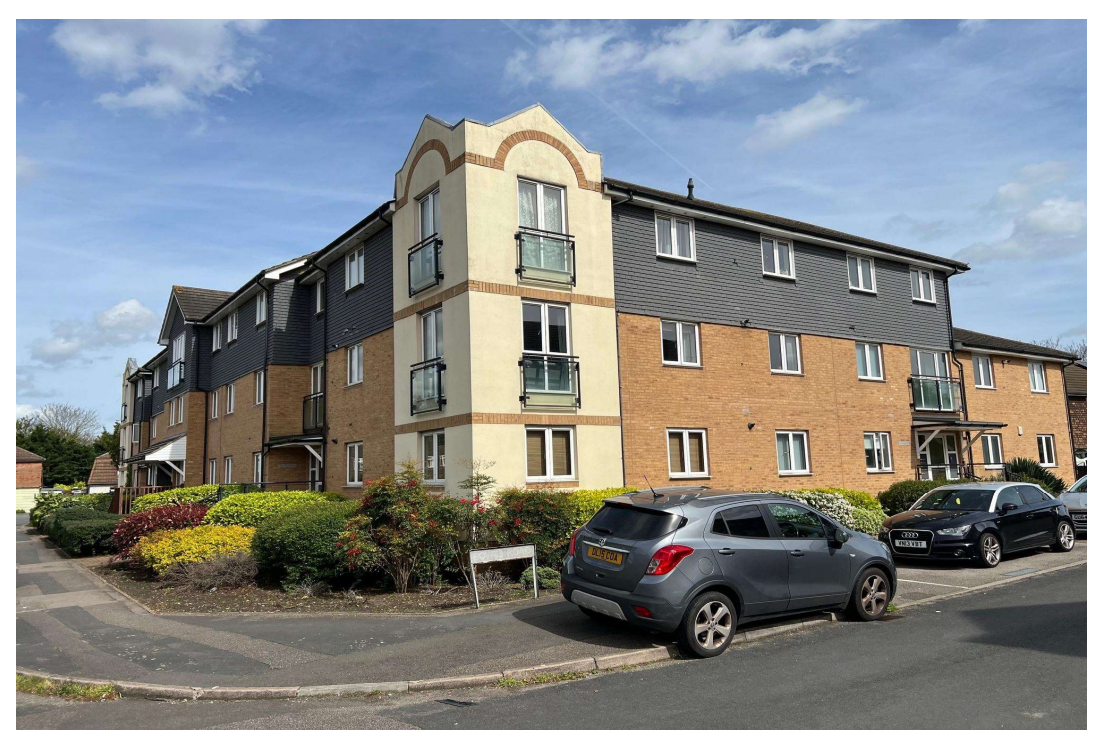
The Rushes, Wapshott Road, TW18 3EZ