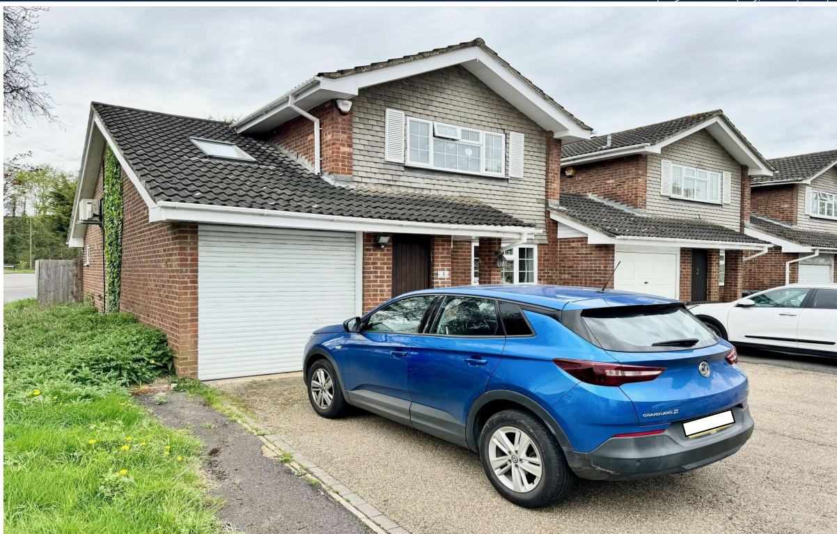
Bourne Meadow, Thorpe, TW20 8QH