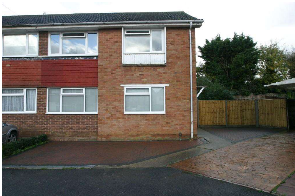
Anderson Drive, Ashford, Middx, TW15 1BG £325,000 Leasehold