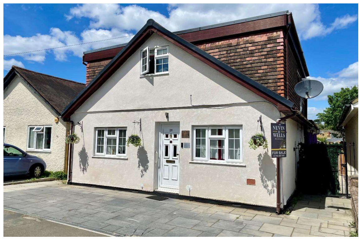
Rusham Road, Egham, TW20 9LP