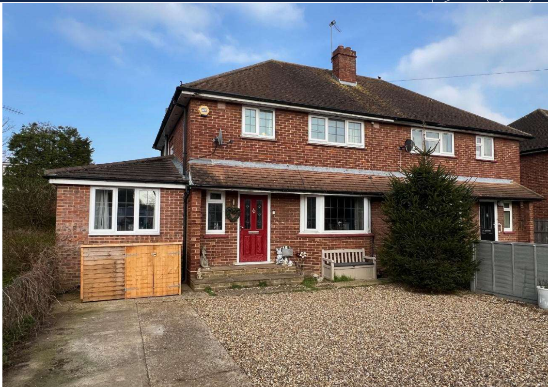
Bishops Way, Egham, Surrey, TW20 8EJ