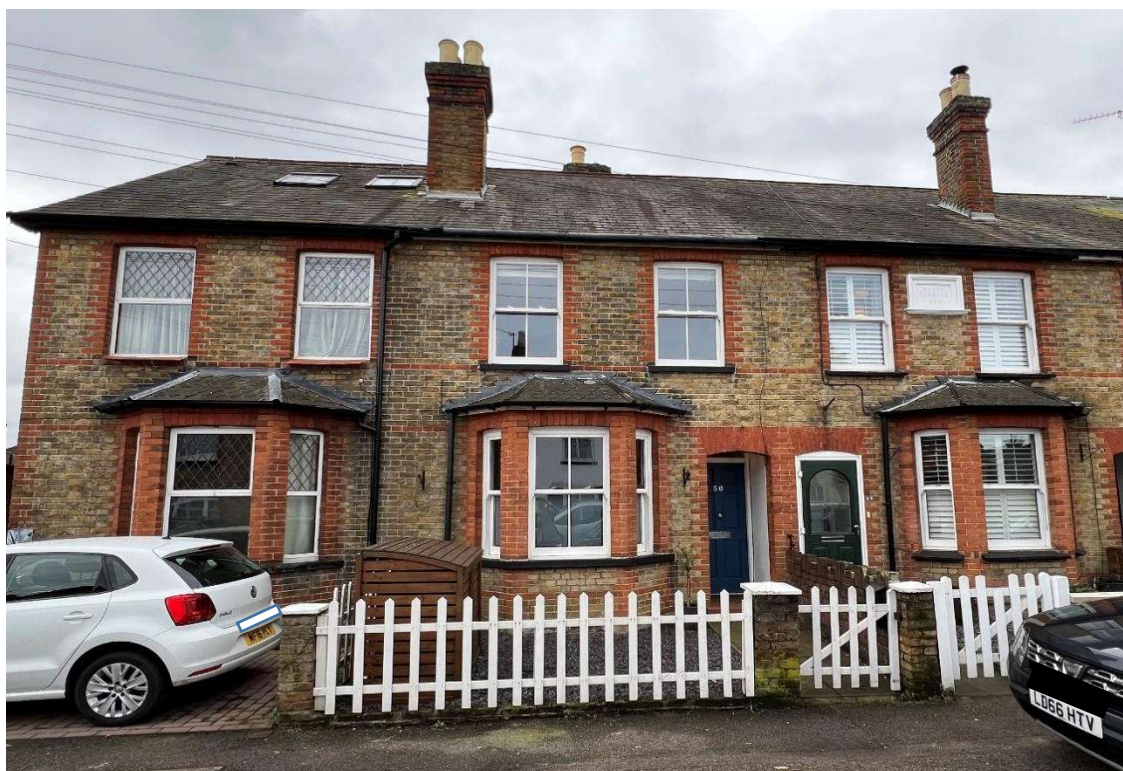
Crown Street, Egham, Surrey, TW20 9BZ