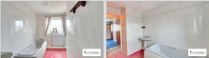
Low level WC, wash hand basin, bath, radiator and a double glazed window.