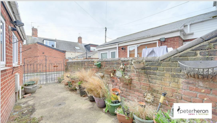
Generous garden to the front. Low maintenance courtyard to the rear with gate to access the back lane.