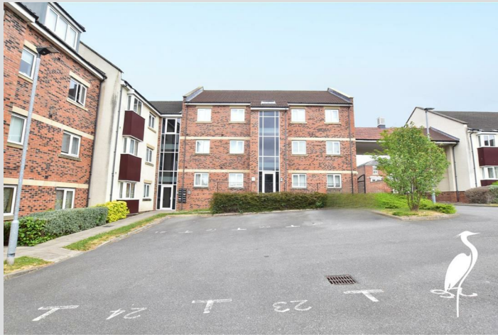
Allocated parking and visitor parking.