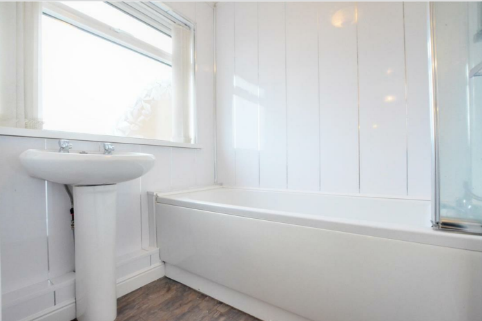
Pedestal basin, bath with overhead shower, UPVC window to rear.