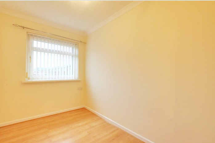
UPVC window to front, laminate flooring, single radiator.