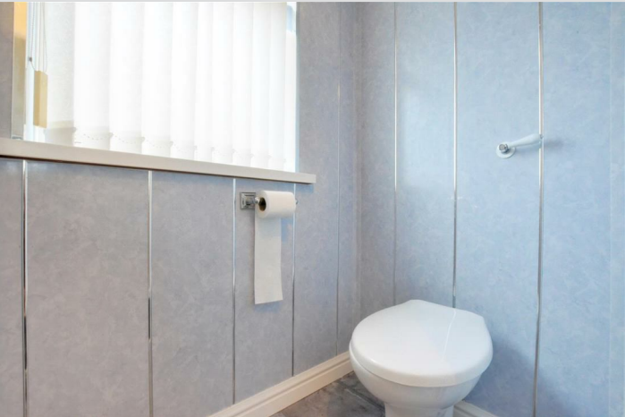
Low level WC, UPVC window to rear.