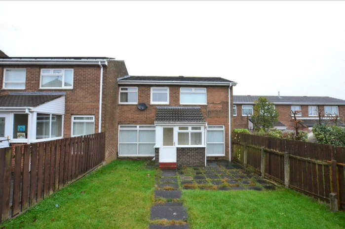
A lawned garden to the front with gated access. Rear lawned garden with mature shrubs with a driveway and garage providing off street parking.