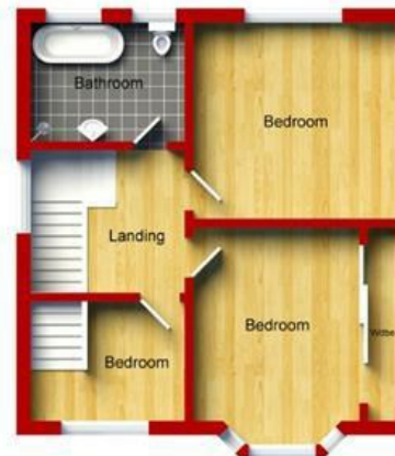
First Floor Approximate Floor Area (45.70 sq.m)