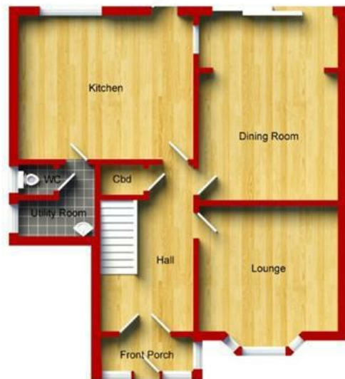
Ground Floor Approximate Floor Area (71.70 sq.m)