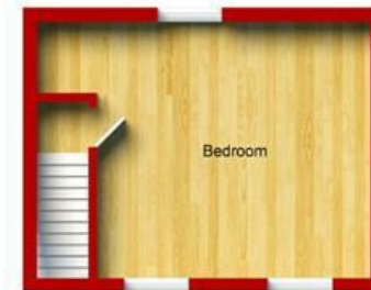
Room In Roof Approximate Floor Area (26.30 sq.m)