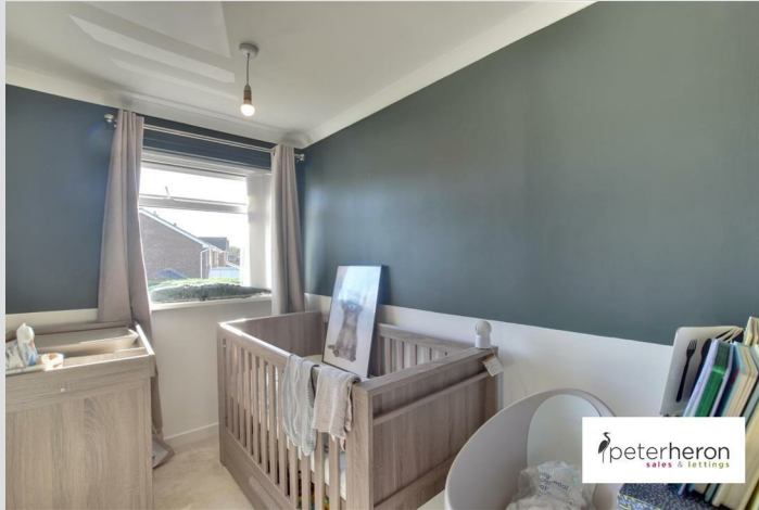
Double glazed window to front and radiator.