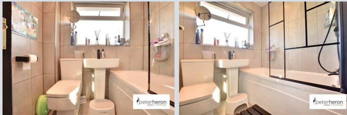
Low level WC, washbasin and bath with waterfall shower over, tiled walls, frosted window rear and heated towel rail.