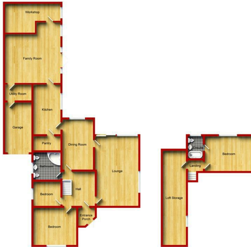
Ground Floor Approximate Floor Area (168.73 sq.m)