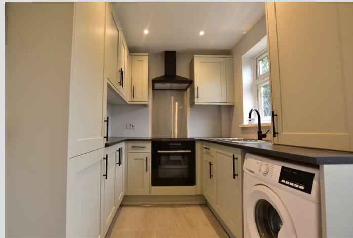
UPVC window and door to rear. BRAND NEW MODERN KITCHEN.