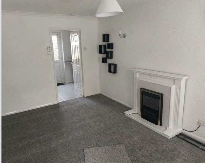
Feature fireplace, stairs to first floor landing, UPVC window to front.