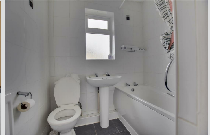
Low level WC, pedestal basin and bath with overhead electric shower, radiator, storage cupboard. UPVC window to rear.