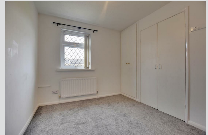
UPVC window to front, built-in wardrobes, single radiator.

Visit www.peterheron.co.uk or call 0191 510 3323