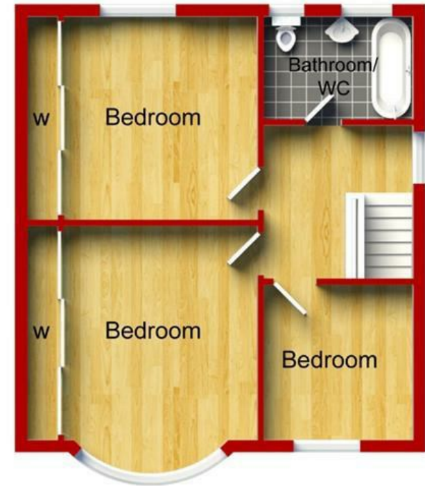
First Floor Approximate Floor Area (45.08 sq.m)