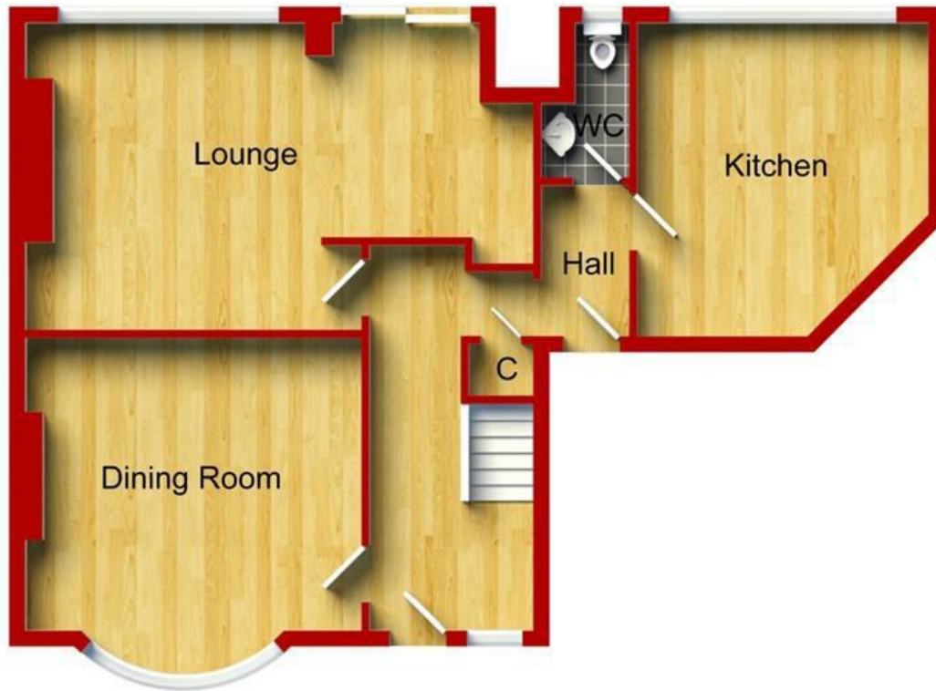
Ground Floor Approximate Floor Area (71.94 sq.m)