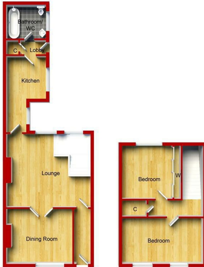
Ground Floor Approximate Floor Area (55.78 sq.m)