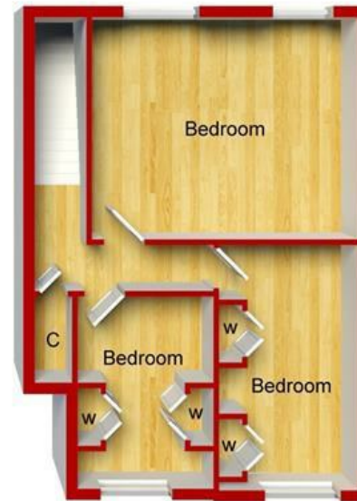
First Floor Approximate Floor Area (47.09 sq.m)