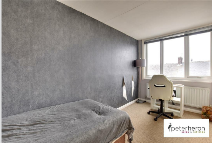
Double glazed window to the front, radiator and fitted wardrobe.