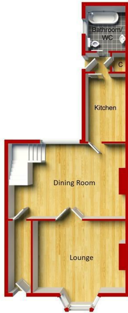
Ground Floor Approximate Floor Area (64.85 sq.m)