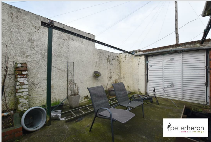
Small forecourt area to the front and a yard to the rear with an up and over access door.