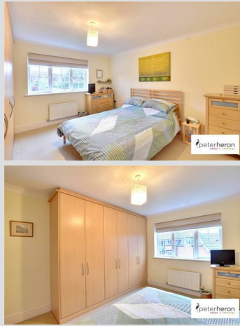
An impressive room with fitted wardrobes, UPVC double glazed window and access to an en-suite.