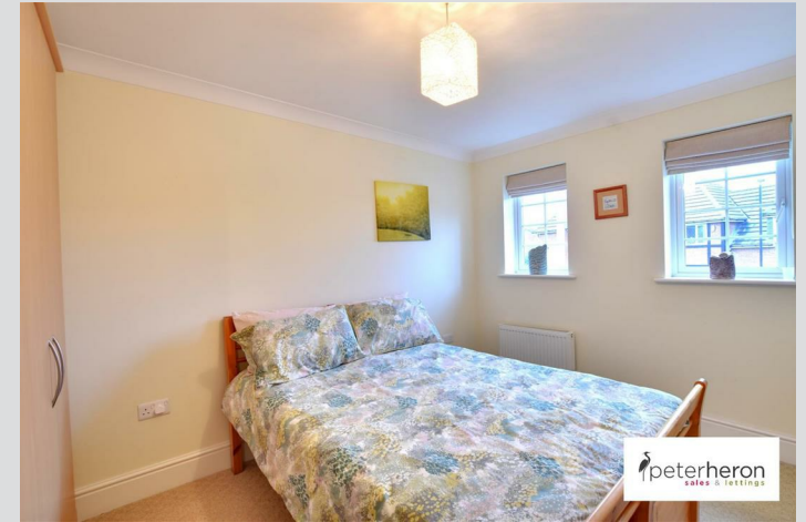
UPVC double glazed window, fitted wardrobes and a radiator.

Visit www.peterheron.co.uk or call 0191 510 3323