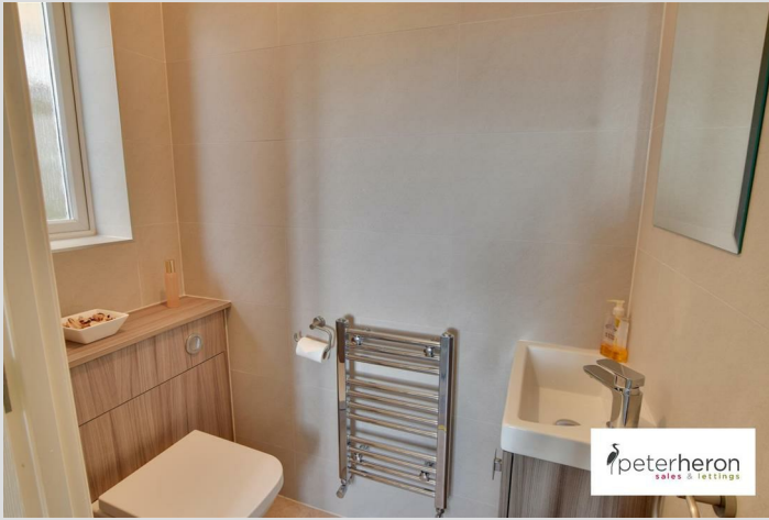
Low level WC, wash basin- attractive white suite with wall and floor tiles UPVC double glazed window.