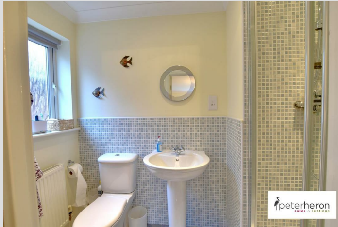
Low level WC, pedestal wash basin and shower cubicle-