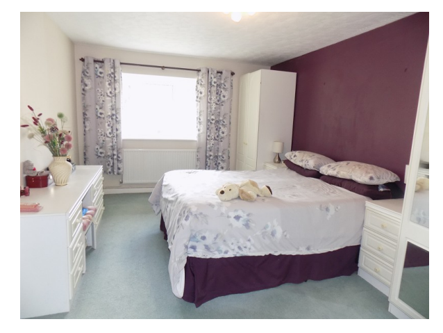
For more photos please see www.pjchomes.co.uk