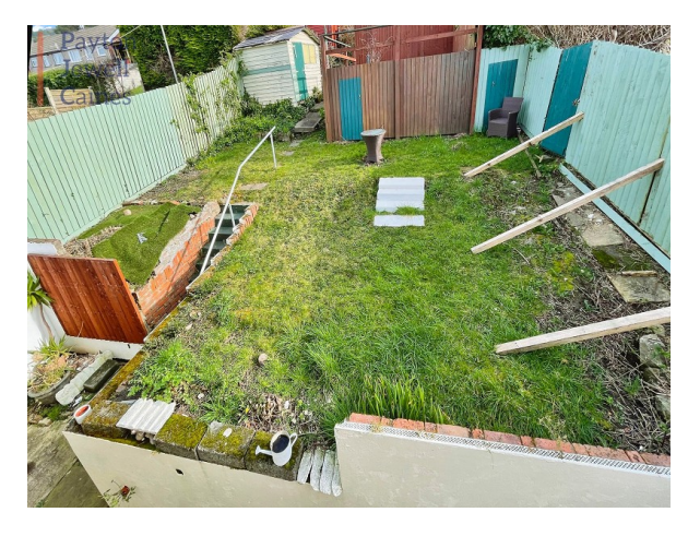
For more photos please see www.pjchomes.co.uk