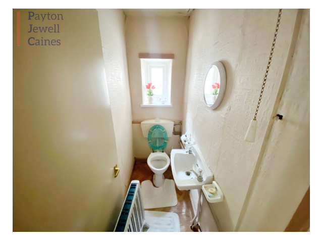
For more photos please see www.pjchomes.co.uk