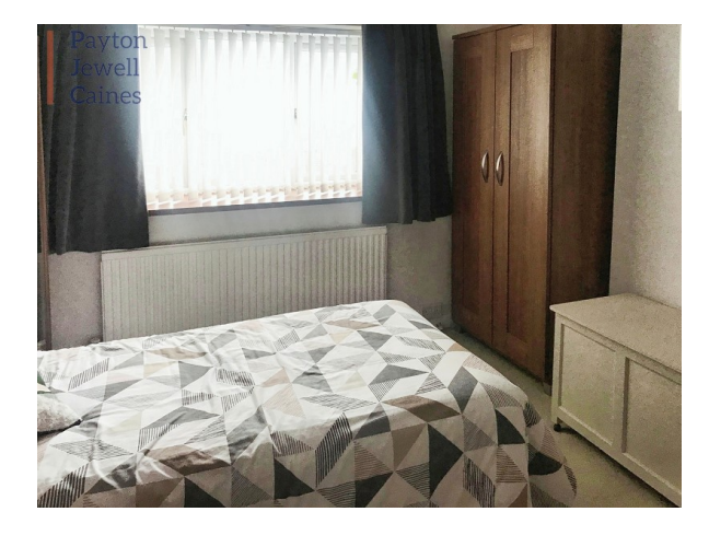
For more photos please see www.pjchomes.co.uk