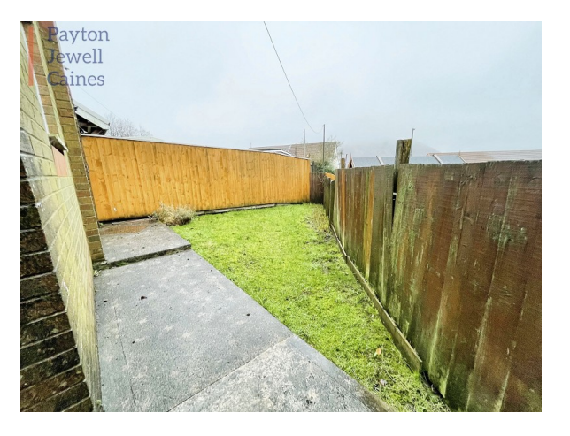
For more photos please see www.pjchomes.co.uk