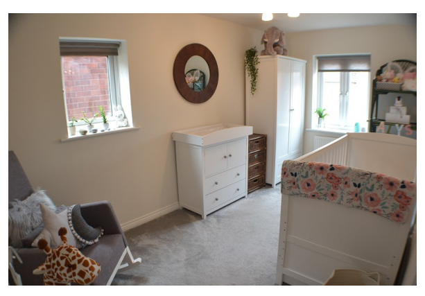
For more photos please see www.pjchomes.co.uk