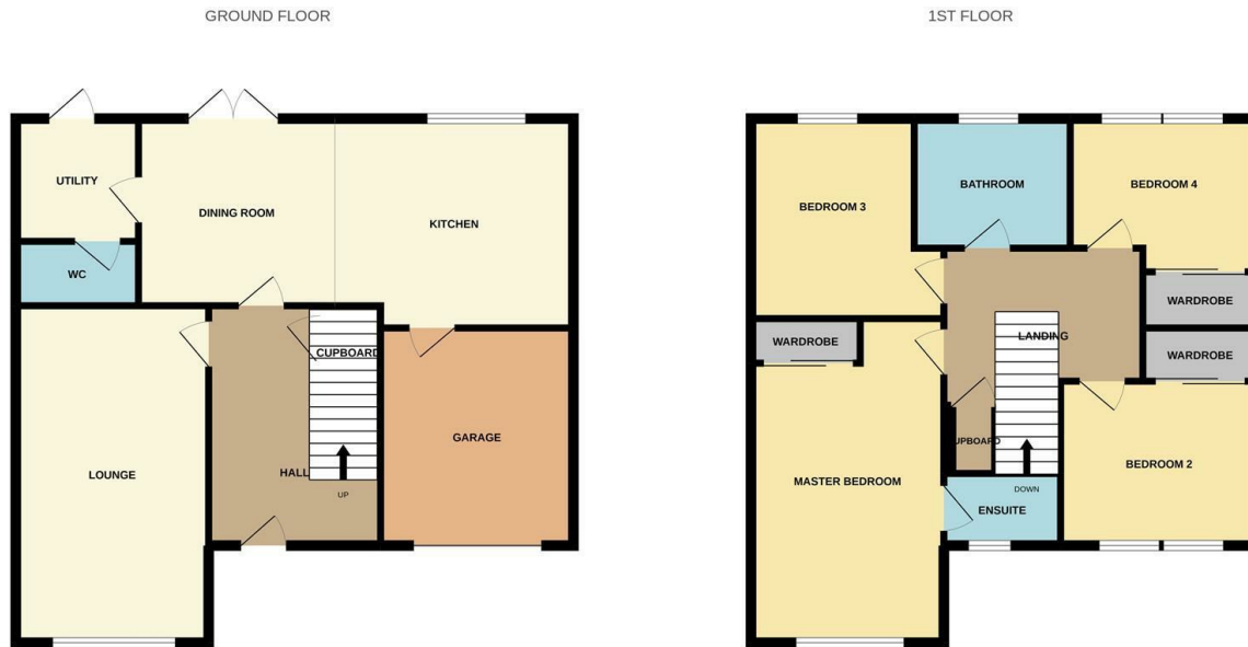
ANNES VIEW, LESMAHAGOW, LESMAHAGOW ML11

Whilst every attempt has been made to ensure the accuracy of the floorplan contained here, measurements of doors, windows, rooms and any other items are approximate and no responsibility is taken for any error, omission or mis-statement. This plan is for illustrative purposes only and should be used as such by any prospective purchaser. The services, systems and appliances shown have not been tested and no guarantee as to their operability or efficiency can be given. Made with Metropix ©2022