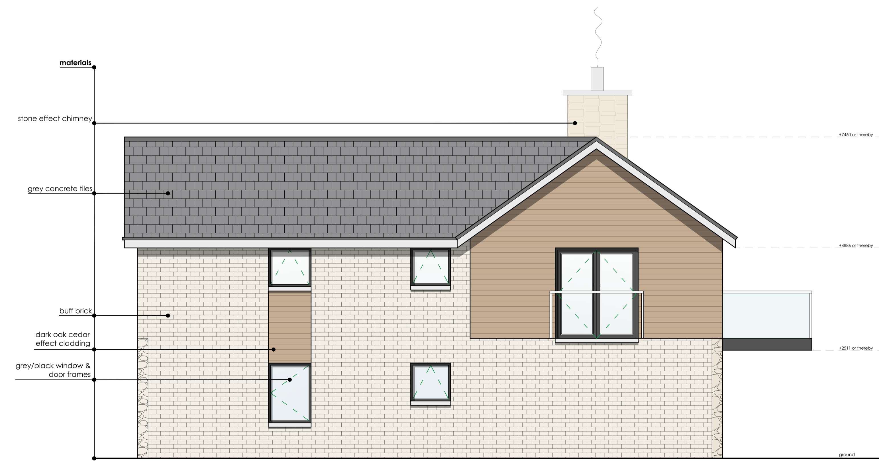
REAR ELEVATION scale 1:50 @ A1