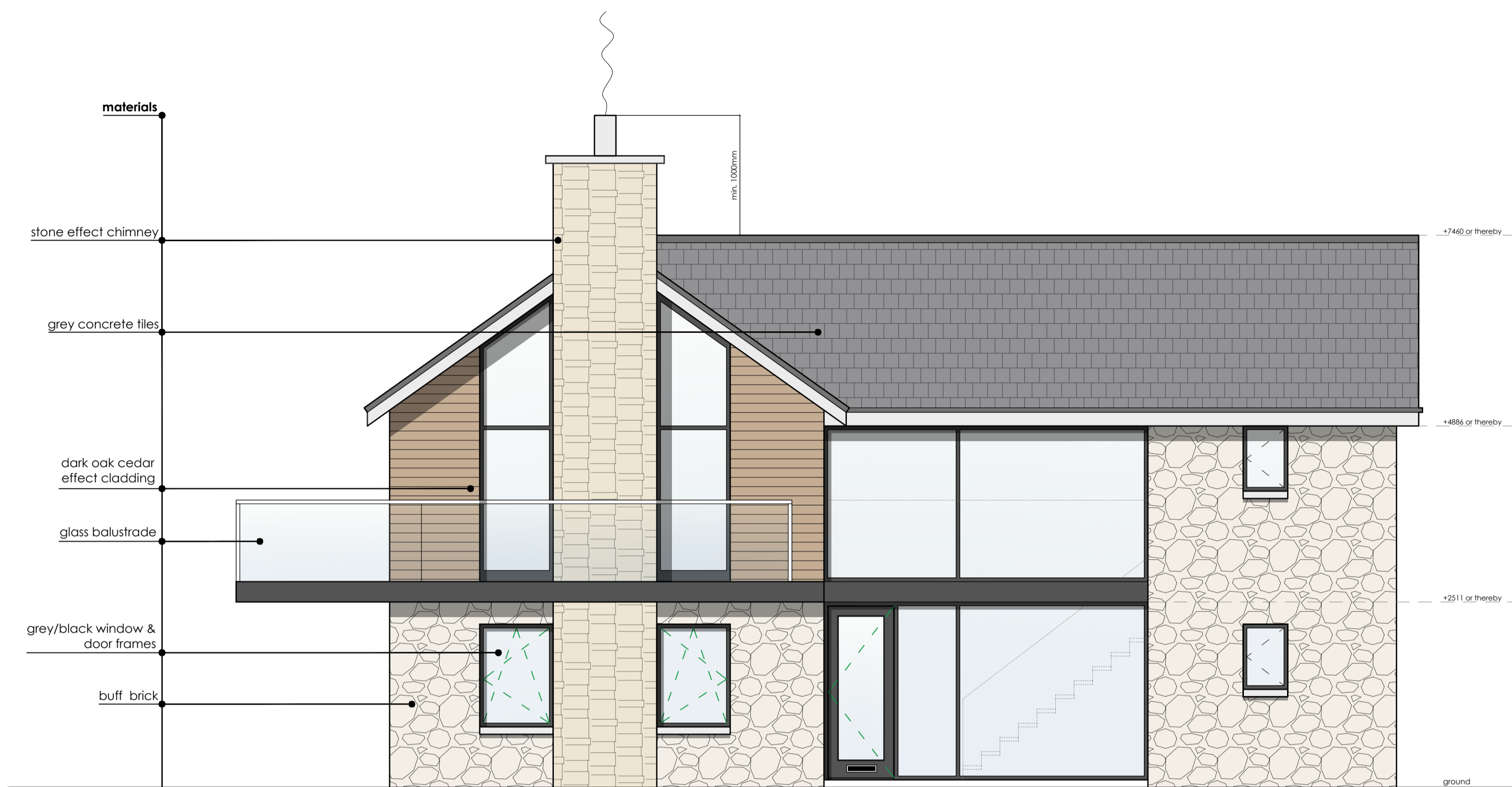
FRONT ELEVATION scale 1:50 @ A1