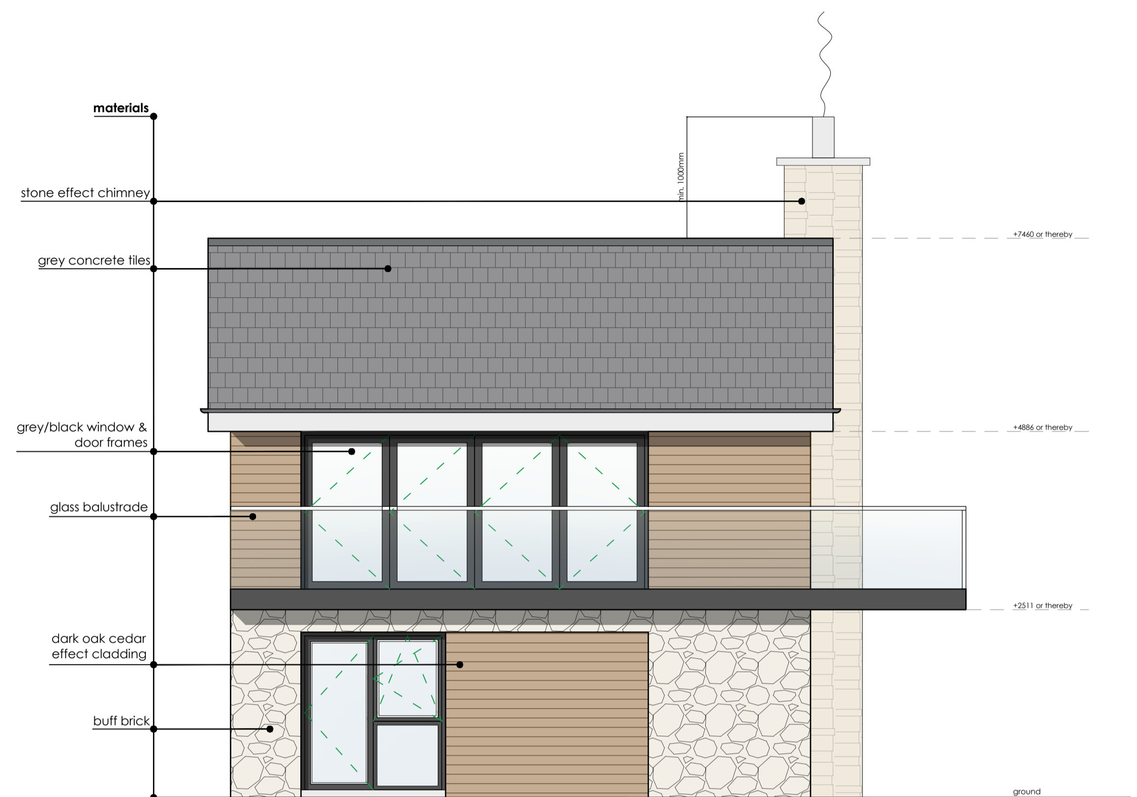
RIVER ELEVATION scale 1:50 @ A1