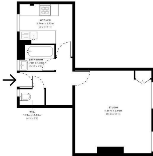
— Second Floor